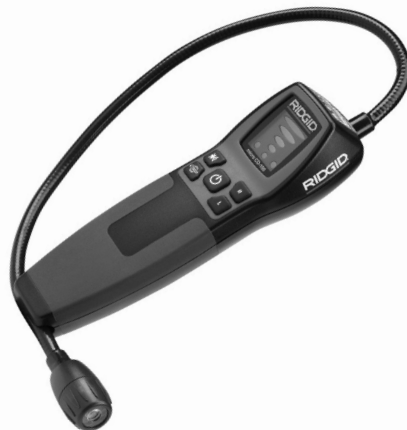
Figure 1 – RIDGID micro CD-100 Combustible Gas Detector