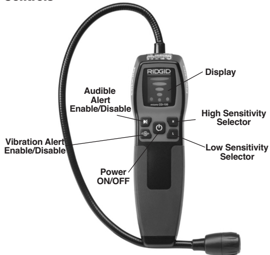
Figure 2 – micro CD-100 Parts