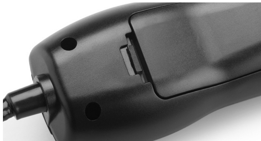
Figure 5 – Battery Cover Clasp