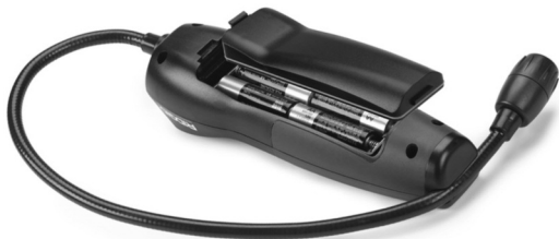
Figure 4 – Removing Battery Compartment Cover